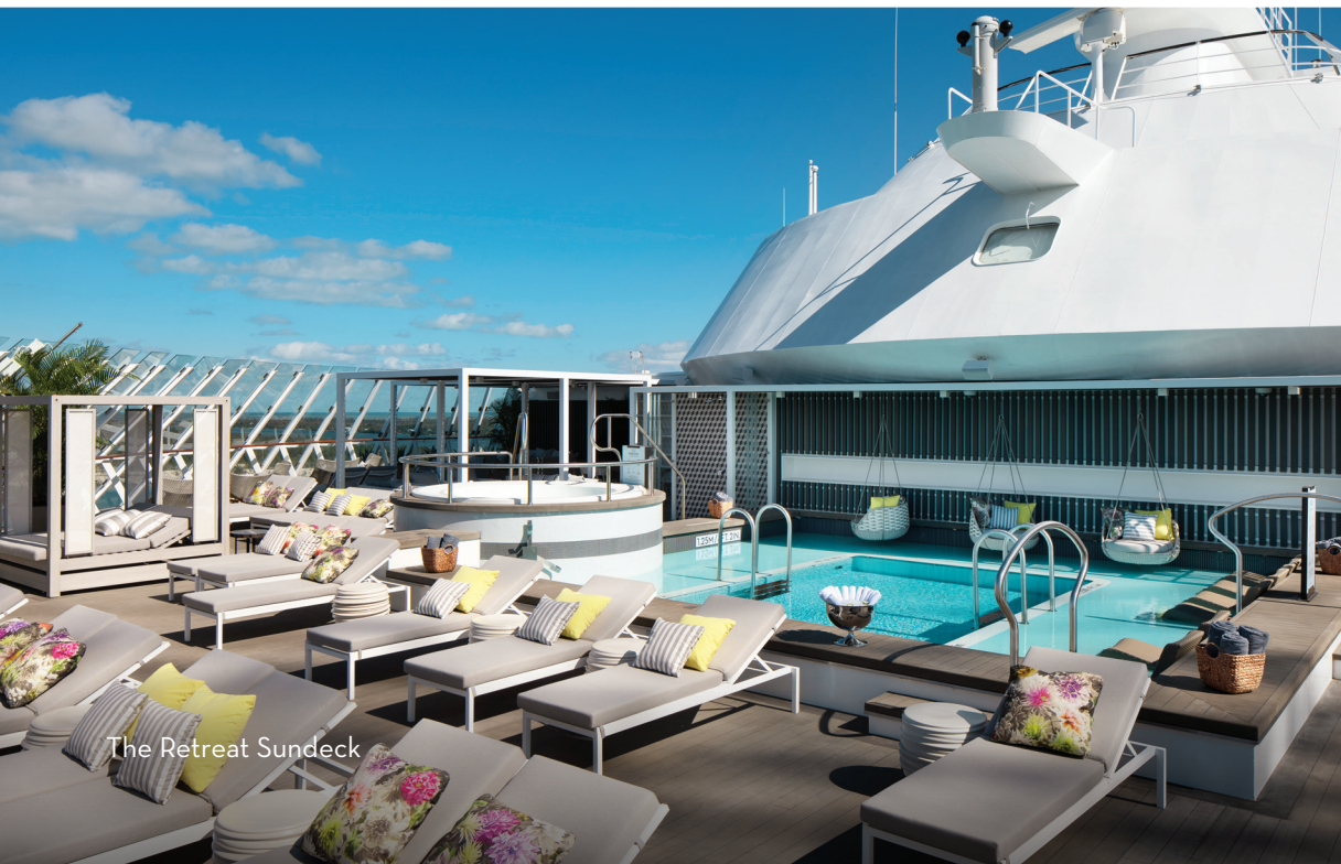
The Retreat Sundeck

This exclusive lounge is available 24/7, and inside, you'll discover a warm and inviting space—perfect for relaxing. Enjoy complimentary beverages and gourmet bites. And, a dedicated concierge can make any arrangements you need—on board or off.