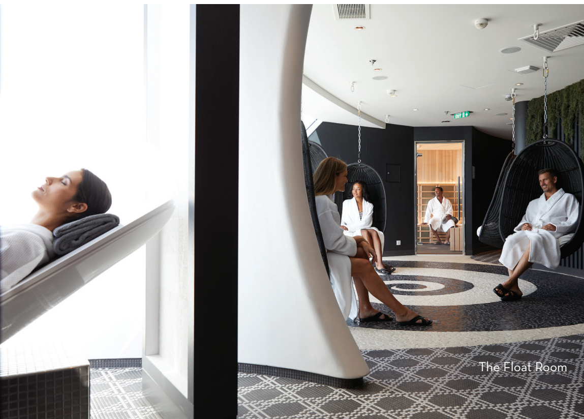
The Float Room

An evolution of our popular Persian Garden, The SEA Thermal Suite includes eight distinctive therapeutic experiences, all inspired by nature. The Hammam is our modern take on the traditional Turkish bath. Relax and take a deep healing breath in the Salt Room. Soothe your senses in the Steam Room as toxins melt away from your body. Step into the massaging Rainfall Water Therapy Room. Relax in the Infrared Sauna Room, as warm air relieves stress. Meditate in our luminous Crystalarium, as healing energy exudes from the natural stone walls and amethyst crystal. And experience panoramic sea views in the Float Room, cocooned in floating basket chairs, or reclining on heated tile loungers. Come experience everything you'd expect on a ship designed to create a greater connection between you, the sea, and the world beyond. It's truly ahhh-mazing.