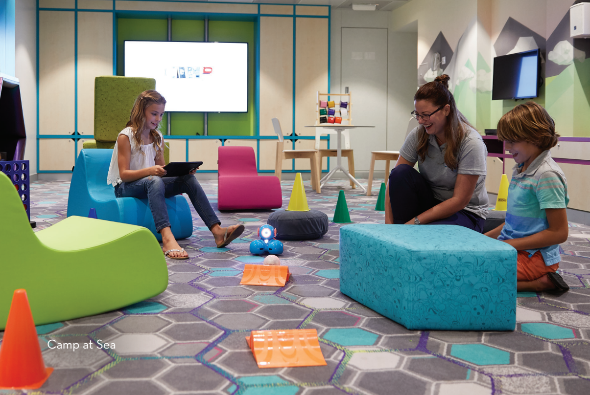
Camp at Sea

Gathering space by day and a place of wild discovery by night—this transformative venue will have you coming back for more. Experience everything from gaming and live DJ performances to new evening productions that will entertain you long past your bedtime.