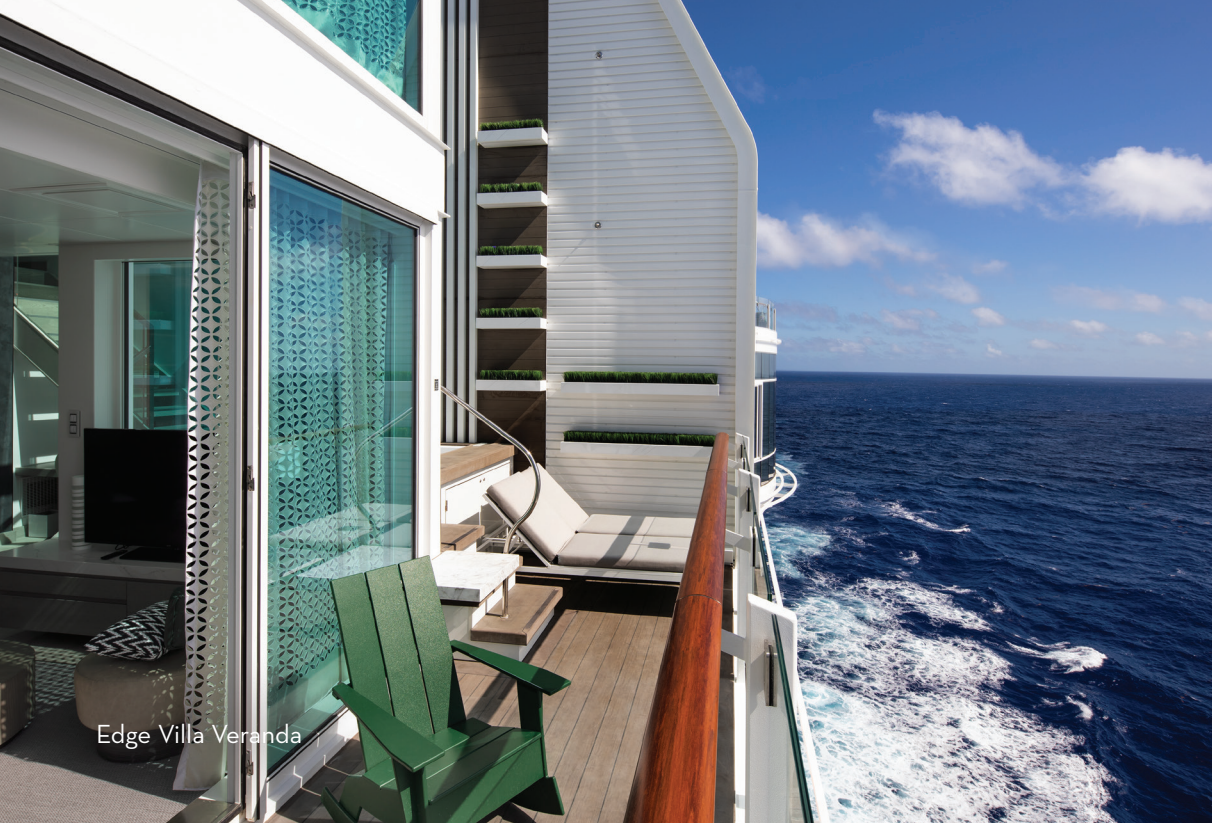
Edge Villa Veranda