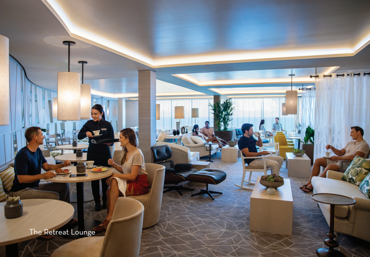
The Retreat Lounge