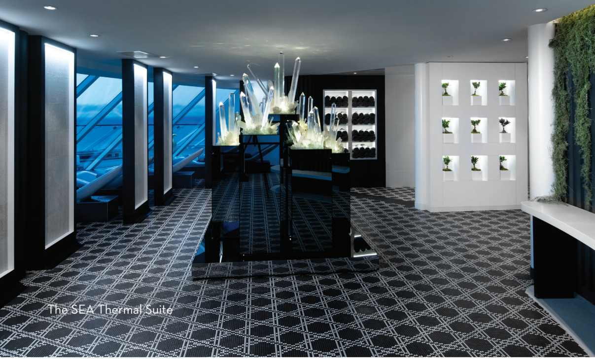
The SEA Thermal Suite