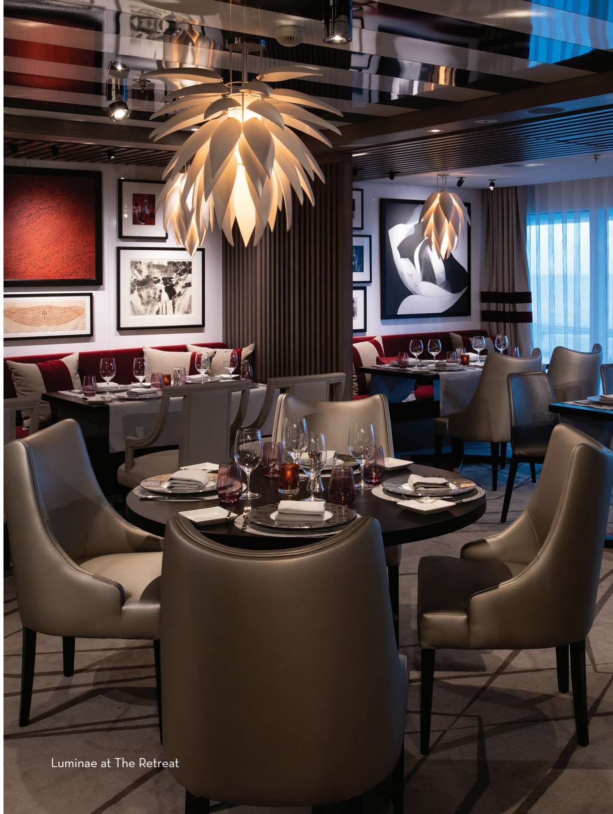
Luminae at The Retreat

*All Included amenities are not included with special fares or MoveUp upgrades from any non-suite stateroom.