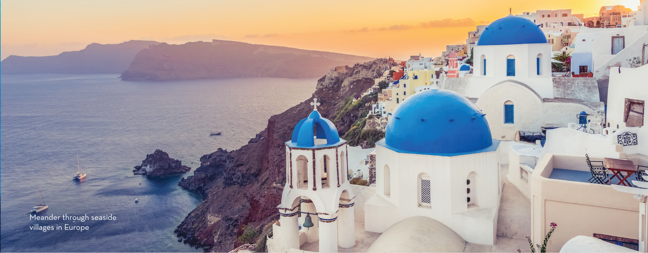
Meander through seaside villages in Europe