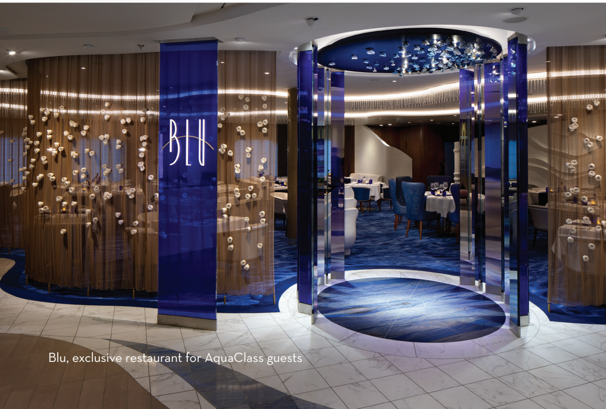
Blu, exclusive restaurant for AquaClass guests

FOR MORE ON OUR STATEROOMS AND SUITES, VISIT CELEBRITY.COM