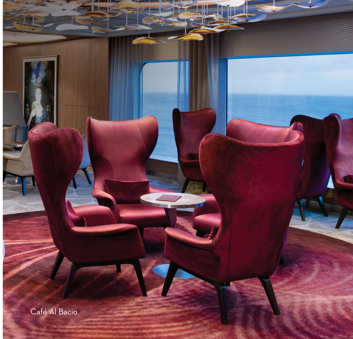
Café Al Bacio

*Craft Social Bar is on Celebrity Apex® and Celebrity Beyond SM , and The Casino Bar is only on Celebrity Edge®.