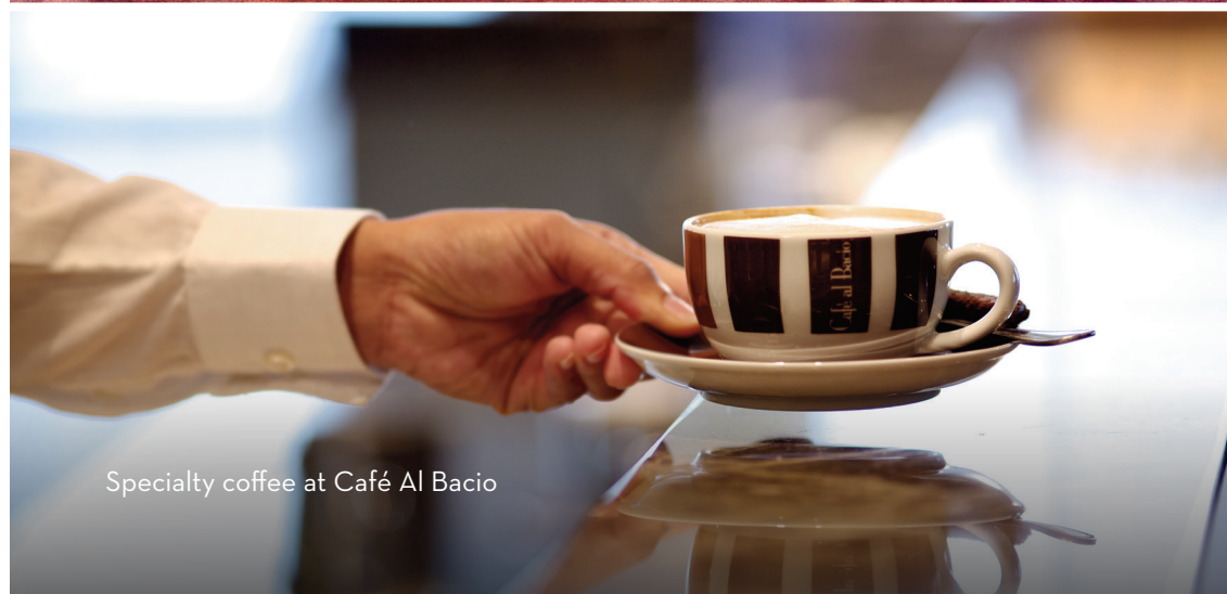
Specialty coffee at Café Al Bacio