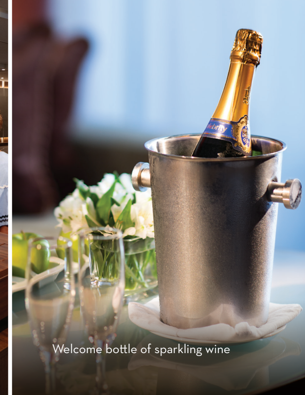
Welcome bottle of sparkling wine