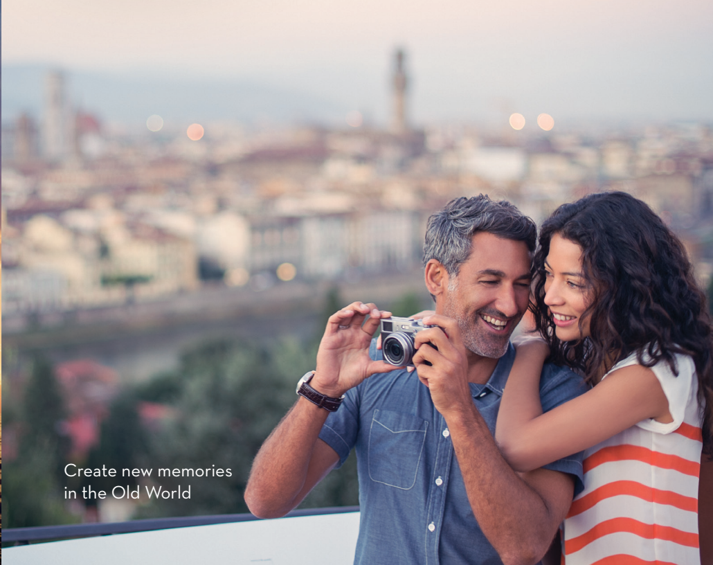
Create new memories in the Old World