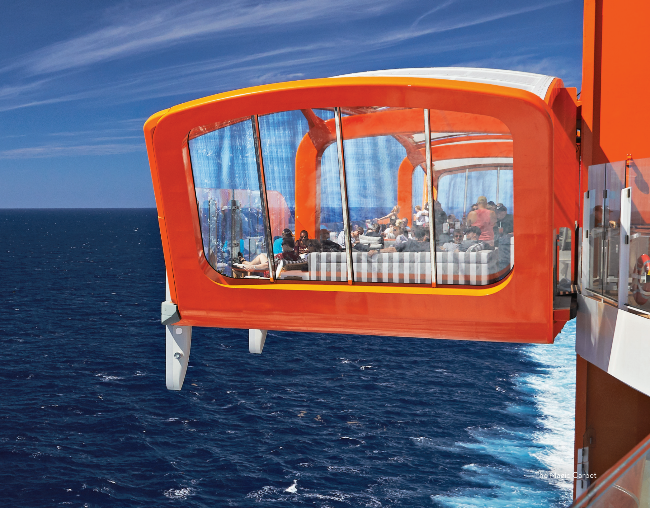
The Magic Carpet