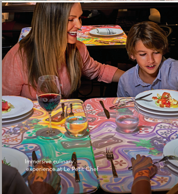
Immersive culinary experience at Le Petit Chef