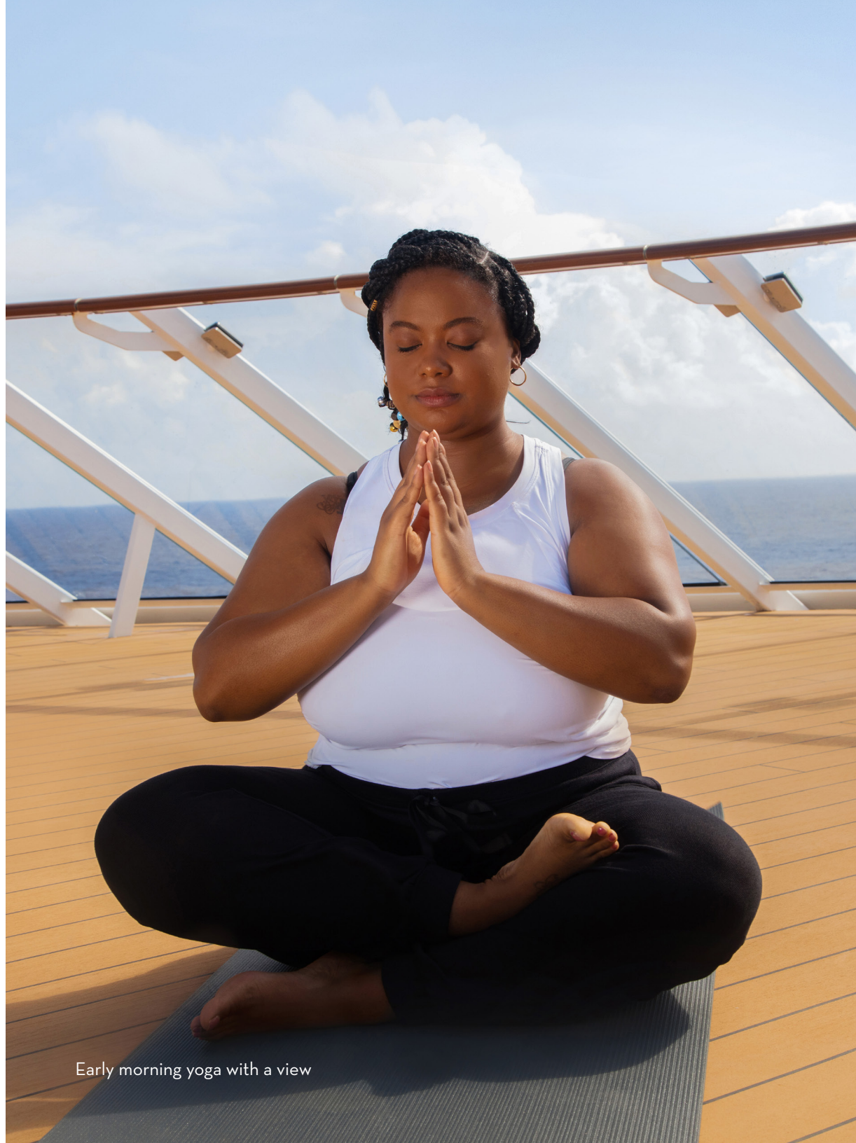
Early morning yoga with a view