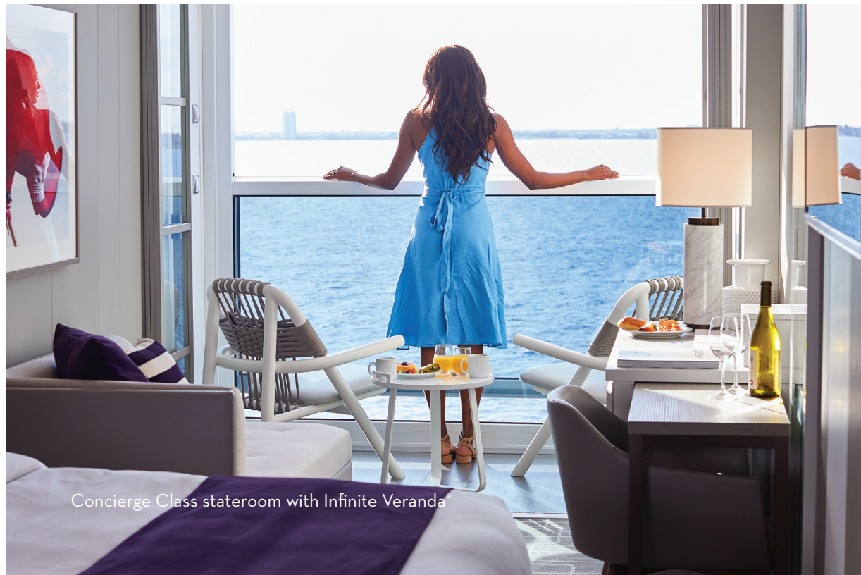
Concierge Class stateroom with Infinite Veranda