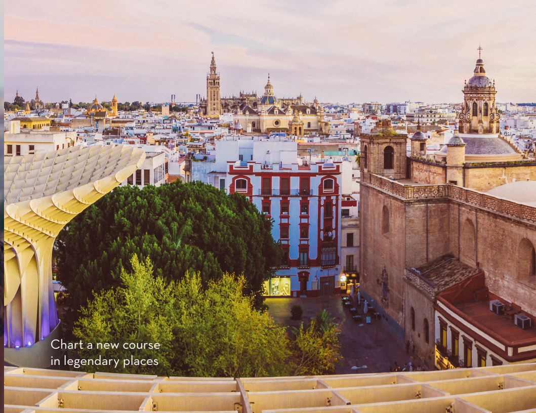
Chart a new course in legendary places